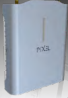
Pixel IoT Gateway