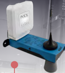
Pit water height detector